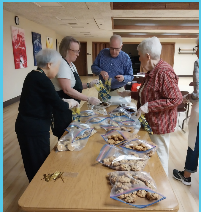
Volunter Corps assembling Father's Day cookie gifts!