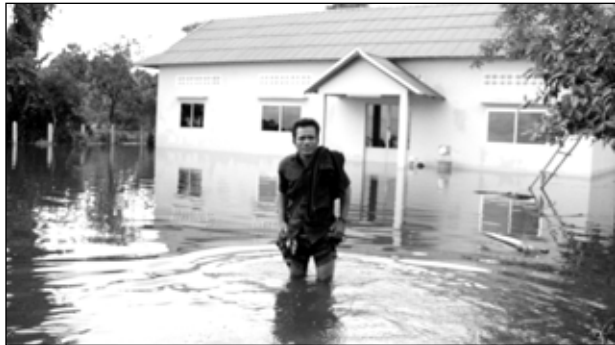
The church that we helped build, sadly in the flood.