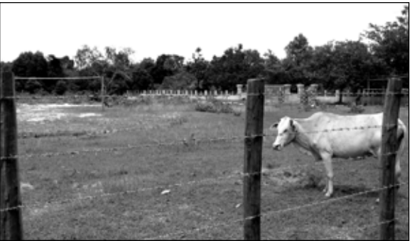
The Children’s Center property, above flood level, and a cow.

ខ្ញុំនឹងធ្វើដំណើរទៅបំពេញបេសកកម្មនៅមណ្ឌលកូនក្មេងរបស់យើងក្នុងខែ១១នេះ ប្រសិនបើពួកជំនុំចង់ចូលជំនួយសំរាប់ការងារក្នុងមណ្ឌលនោះ ឬជួយដល់គ្រួសារជនរងគ្រោះដោយទឹកជំនន់ សូមទាក់ទងនឹងខ្ញុំ នេះគឺជាទីបន្ទាល់មួយដ៏ល្អក្នុងពេលរងគ្រោះ។ ផ្សាយដំណឹងដោយលោកគ្រូ ភីធី អ៊ឹម